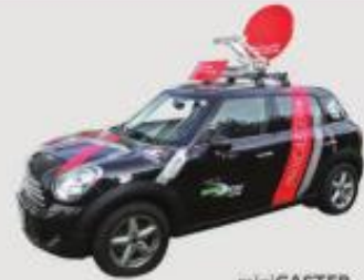
miniCASTER NewsSpotter Car Unit from £4,495

Prices correct at time going to press and subject to change without notice. Prices excluding VAT E&OE.