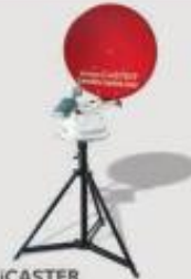
miniCASTER NewsSpotter Fly Away from £5,995