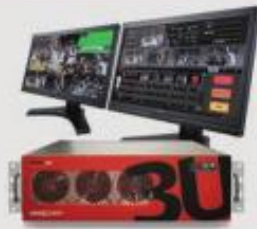
Streamstar WEBCAST 3U / Sport Webcasting Studio £13,425