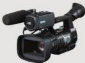
JVC GY-HM600 £2,500 JVC GY-HM650 £3,195

Just add cameras and this is everything you need for a professional live broadcast to millions of people across the world. This is outside broadcast at its most compact, most affordable and easiest to use." * within the Eutelsat footprint